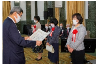
The 53rd Hakuho Award presentation ceremony

This award was created at the time of the foundation's establishment with the aim of revitalizing and supporting the field of child education. It recognizes grassroots activities and contributions of schools, organizations, and educators in six areas, including Japanese language education, special needs education, and international culture and multicultural education, which have a potential ripple effect in the educational field. The foundation also supports the sharing of achievements and the continuation and expansion of activities. The Hakuho Award was presented for the 54th time in fiscal 2023, and 12 projects were selected as recipients.